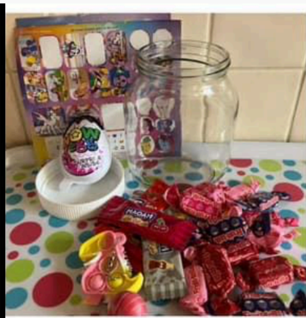
HOW IT STARTED