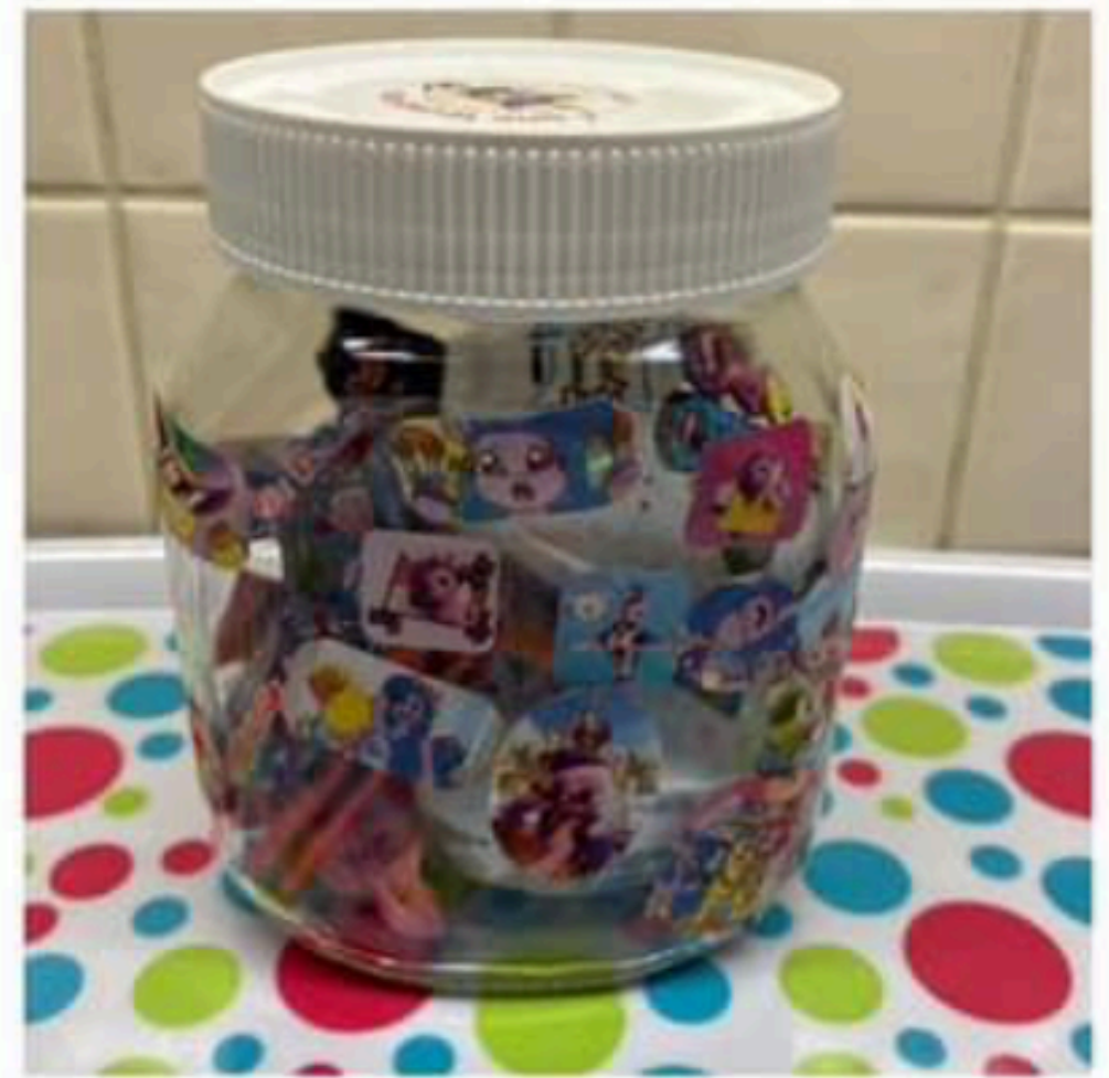
FINISHED JOLLY JAR